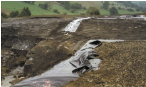
Figure 1: Synthetic and geofabric cover over a sulphide waste rock pile, Y Fan mine, Wales.

Traditionally, attempts have been made to remove or reduce oxygen and moisture by the placement of thick barriers over the waste. Such a barrier could include a geomembrane or geofabric cover (figure 1). Fine-grained covers rely on the moisture-retaining characteris-